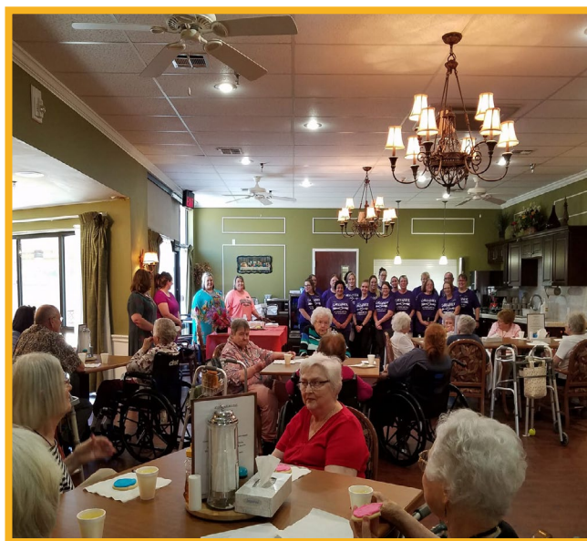
The Wheatlands celebrating CNA week.